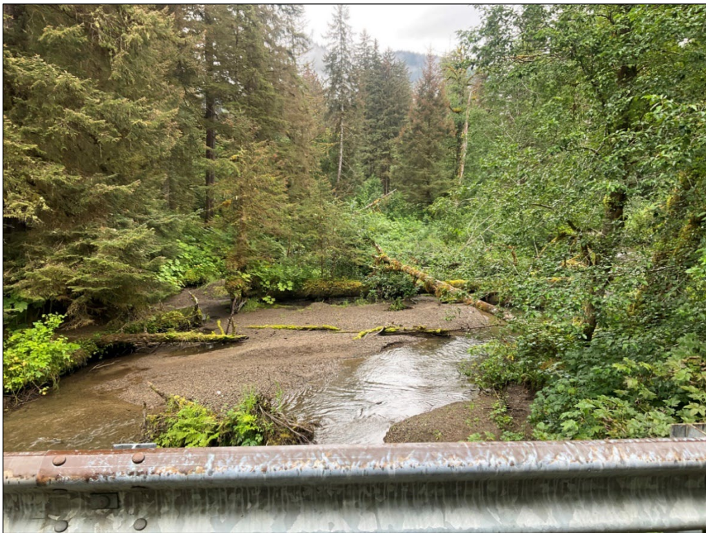
Figure 2.–Bridge at waypoint 1484 facing upstream.