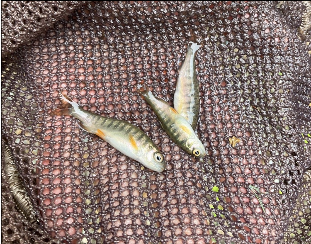
Figure 1.–Juvenile coho captured at waypoint 1399.